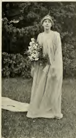
FRESHMAN MISTRESS OF CEREMONIES.